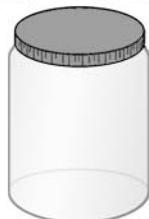
CLEAR CONTAINERS WITH LIDS